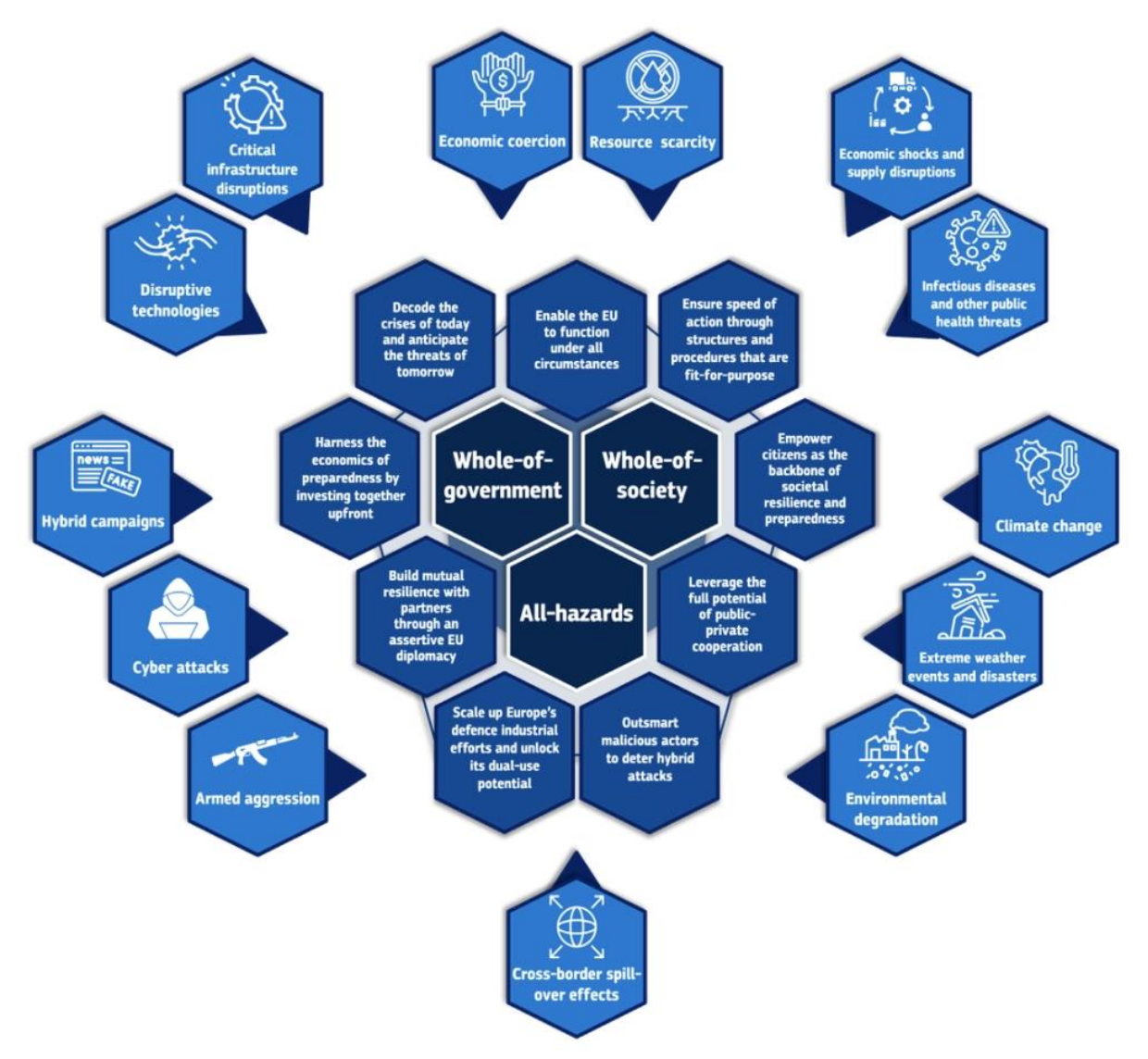
Fig. 2: The building blocks of a fully prepared Union [12, p. 31.]