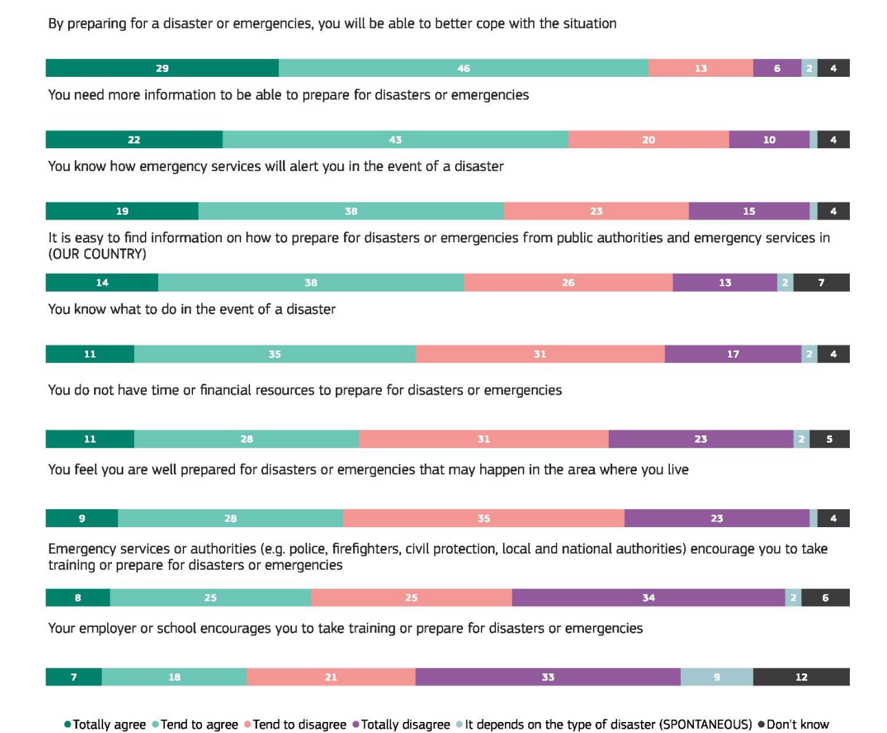
Fig. 3: The "Personal preparedness in the event of a disaster" answers in the EuroBarometer

The report calls for strengthening the Single Intelligence Analysis Capacity (SIAC), including a general deepening of intelligence exchange between EU member states. Although a certain level of trust is part of international cooperation (and in this case, its enhancement), the idea of setting up an EU-level agency for joint information sharing and intelligence does not seem viable. Member states do not have common intelligence, espionage, national security standards, and due to the nature of the activity, their ad-hoc or ongoing sharing (e.g. a country's nuclear security portfolio) is (can) not necessarily based on trust.