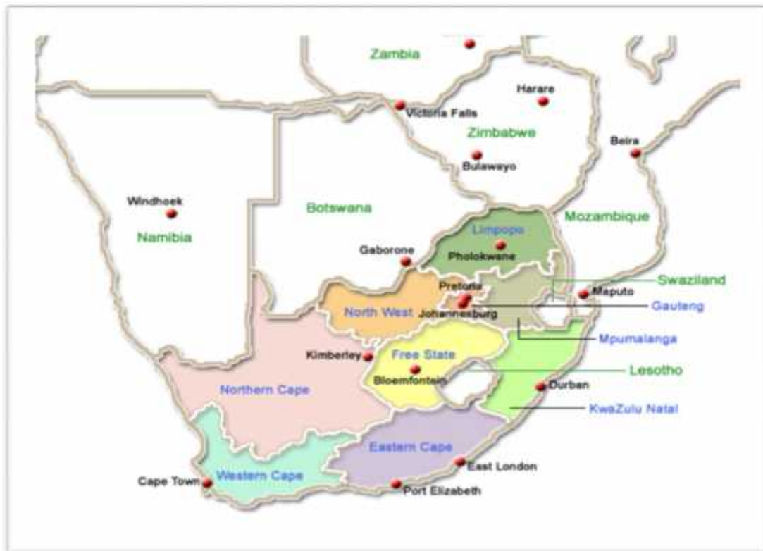
Figure 1: Map of South Africa showing provinces.

Both the white and colored populations constitute 8.9% each. While Indian/Asians constitute 2.5% of the population, it is interesting to note that they make up 16.7% of eThekweni metropolitan municipality (Durban) (Statistics South Africa, 2012). The city of Cape Town is the legislative capital of the Western Cape Province. According to a statistic [20] its population of 3 740 026 is the second largest in the country. The high unemployment rate of 31.9% is unhealthy and can lead to a lot of disgruntlements and possibly high incidence of crime. Although Gauteng is the smallest province, it is the most crowded, highly urbanized region (SA.info, 2016) with a population of 12272263. [20]