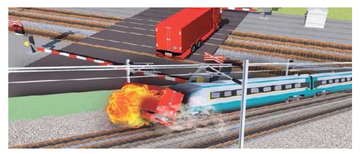
Figure 7: Scenario of traffic accident [10]

In 2015 the Czech Republic the collision was of the vehicle and the train Euro City called Pendolino occurred on the secure level crossing. The driver was driving the vehicle full of plates transporting from Poland to Hungary. He came to railway crossing at the time when warning lights were already active. The gates closed the vehicle on the level crossing. The driver for unknown reasons did not try to break through the gates and escape, but he remained seating in the cabin. The train was moving at a speed 160 km / h. Later the train speed was reduced to 140 km / h. After the crash train was pushing the vehicle and remove his cab. The braking distance of the train was around 500 meters, the train stopped at the platform of the train station. It pushed the debris of the car ahead. Two passengers of trains were killed, the third man succumbed to injuries in the hospital and 18 people were injured. [9]