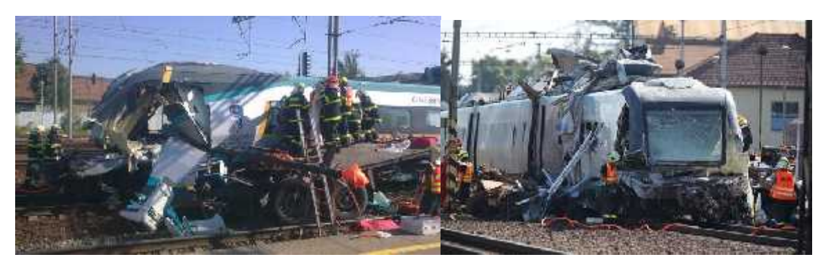
Figure 8: A clash of combination and Eurocity in the Czech Republic [12]

From the perspective of the FRC, the procedure in emergencies is never identical. Every time it is difficult and intensive intervention. Therefore, the FRC commander must choose right intervention procedure and its tactics in order to cope with the situation in affected area and avoid thus possibility of occurring of secondary injuries or further worsening of health of injured people.