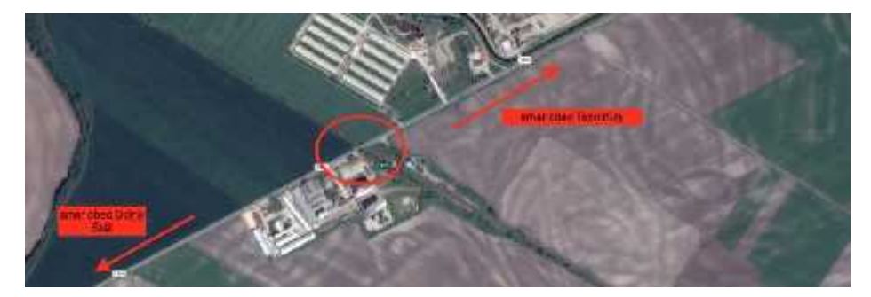
Figure 2: Overview of the incident rainfall combination and a wagon [4]

The number of accidents in 2016 on the level crossings was increasing to 27, five people died and five suffered from serious injuries. As a one of the most difficult event can be called a collision of train with rolling vehicles REX 774 in the direction fromVelkyMedertoKomarno, which occurred on 09/16/2016 7:15 pm.29 people were injured, two people were seriously injured and one person was killed. The precise cause of the incident has not yet known. Each accident on level crossings in Slovakia of the integrated rescue system involved and the department os safety and inspection of ZSR are in charge of the case.