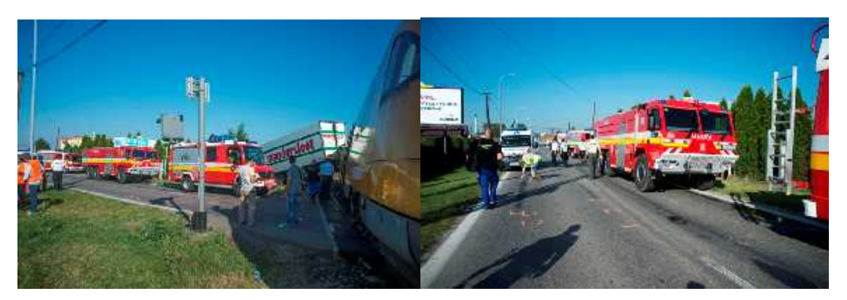
Figure 4: The distribution of firefighting equipment [5]

The Fire and Rescue Service consisted were recovering persons, assisting doctors in the treatment of injured persons, providing assistance in handling of injured persons in vehicles of ambulances and emergency medical assistance and in helicopters of emergency medical services. After that firemen were involved in the removing of accident consequences.