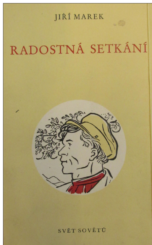
Photo 2. Covers of travelogues from the 1950s