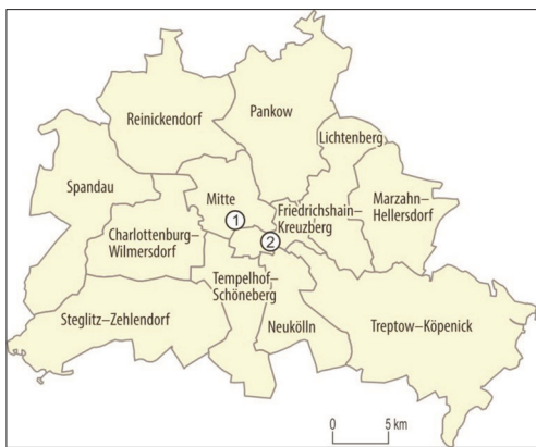
Fig. 2. Survey venues in Berlin. 1 = Brandenburg Gate (Borough “Mitte” – DGB); 2 = Kottbus Gate (Borough “Friedrichshain-Kreuzberg” – MyFest).

In stark contrast, participation levels for events on 1 st of May in Berlin Kreuzberg are rising. In 1987, Kreuzberg protests were the most radical and violent in German history after WWII, as several thousand leftists lighted more than 30 local shops and burned several police cars around the Kottbus Gate, known as the heartland of leftist activists since then (HANNAH, M.G. 2009). As a consequence, from then on several left-wing groups use Labour Day for their own revolutionary march (“Revolutionäre 1. Mai Demo” or Revolutionary 1 May Demo) through Kreuzberg every year at 6 pm. This demonstration – organised by various groups from anti-globalisation movements and migrant organisations to local radical leftists – is attended by about 10.000 people on average every year. Although tensions run high between police and demonstrators during this “radical ritual” (LEHMANN, F. and MEYERHÖFER, N. 2003, 56) in Kreuzberg, the level of violence has changed significantly, since the introduction of the so-called “MyFest” in 2003. This street festival is a deliberate anti-violence strategy and, thus,