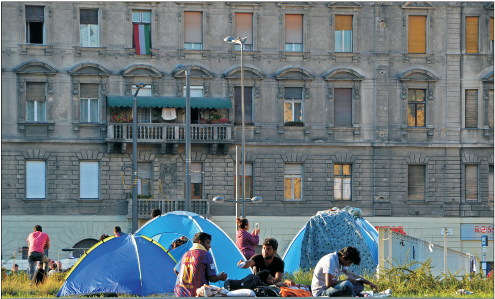
Photo 1. Migrants at the Keleti Railway Station of Budapest, September 2015