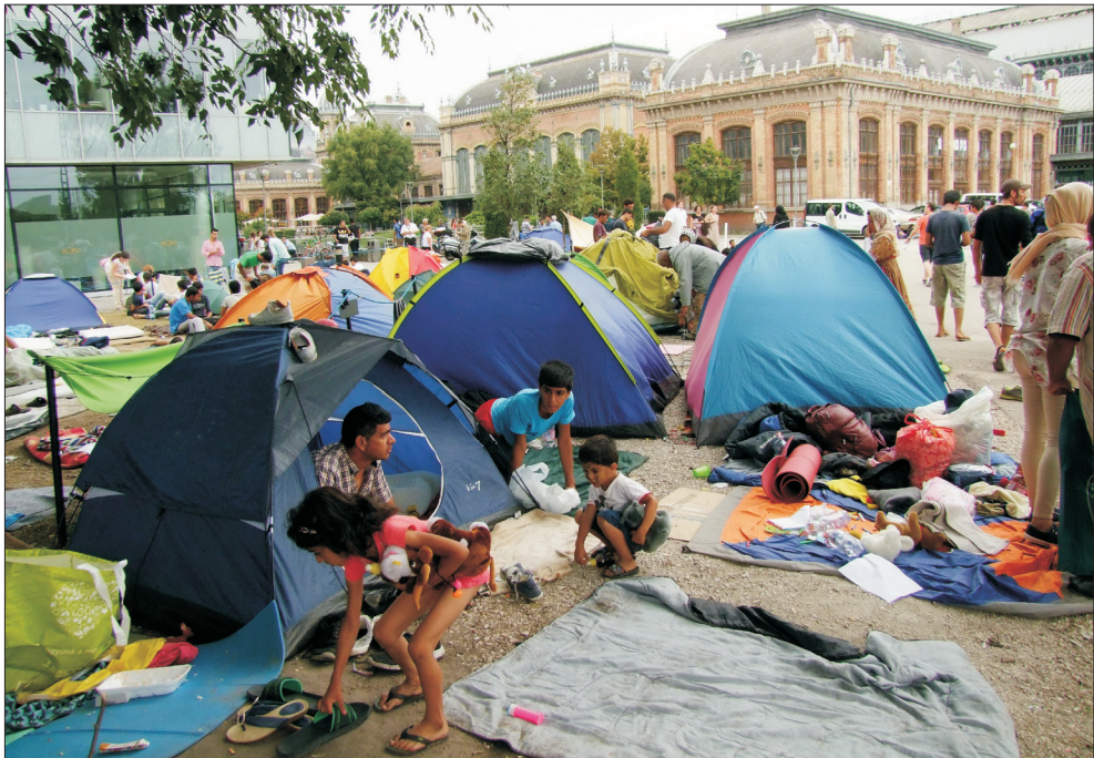
Photo 2. Migrants near the Nyugati Railway Station of Budapest, September 2015