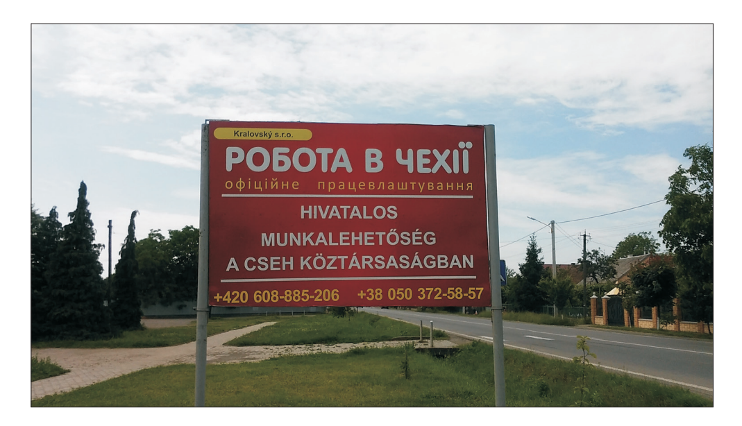
Photo 3. Bilingual (Ukrainian and Hungarian) billboard in the outskirts of Uzhhorod offering legal job opportunities in Czechia.

Following 2014, the Hungarian government has elaborated several economic