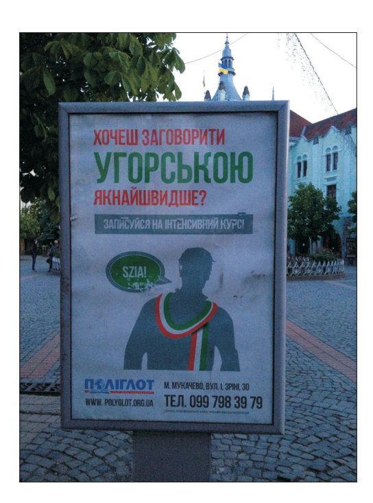
Photo 1. Poster advertising Hungarian language course in Mukacheve (May 2016).

We argue that the motivation of Hungary in organizing free-of-charge language courses is quite clear: to attract desperately needed labour force. At the same time, the motivation of ethnic Ukrainians when learning Hungarian is to gain Hungarian citizenship which serve as a golden ticket to enter the EU job market: