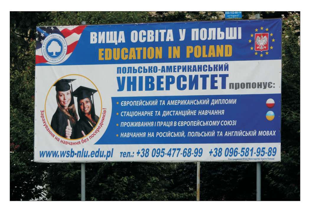
Photo 2. Advertisement of a Polish university in Uzhhorod, the seat of Transcarpathia.

tures have evolved, for instance the increase of permanent residence permit holders in Czechia might suggest the growing intention among Ukrainian migrants to settle for a longer period in the country (Drbohlav, D. and Seidlová, M. 2016). Relevant to present article is the appearance of the so called "Polish route": it refers to a recently reported phenomenon when Ukrainian citizens – to avoid the expensive and far more difficult Czech visa procedure – apply for Polish visa to enter Czechia, their original destination (Drbohlav, D. and Seidlová, M. 2016, 122).