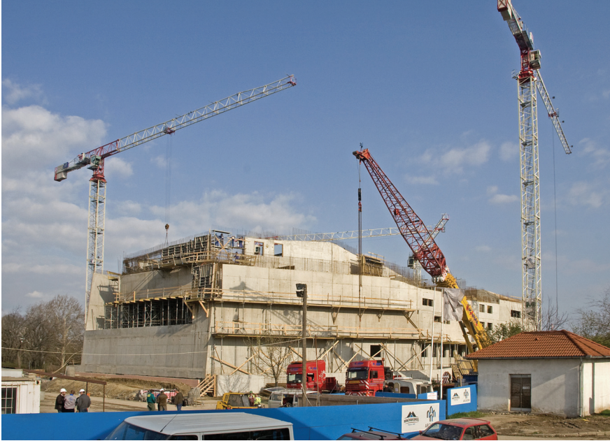
Photo 3. Conference centre and concert hall complex under construction