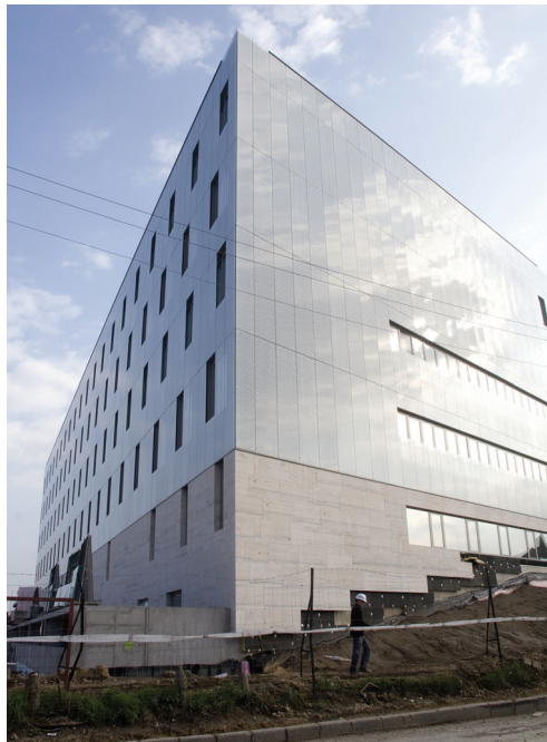
Photo 2. Regional Knowledge Centre of South Transdanubia