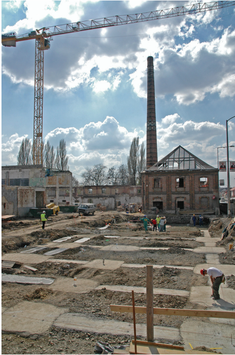
Photo 1. Zsolnay Cultural Quarter emerging on the place of a renowned ceramics manufacture