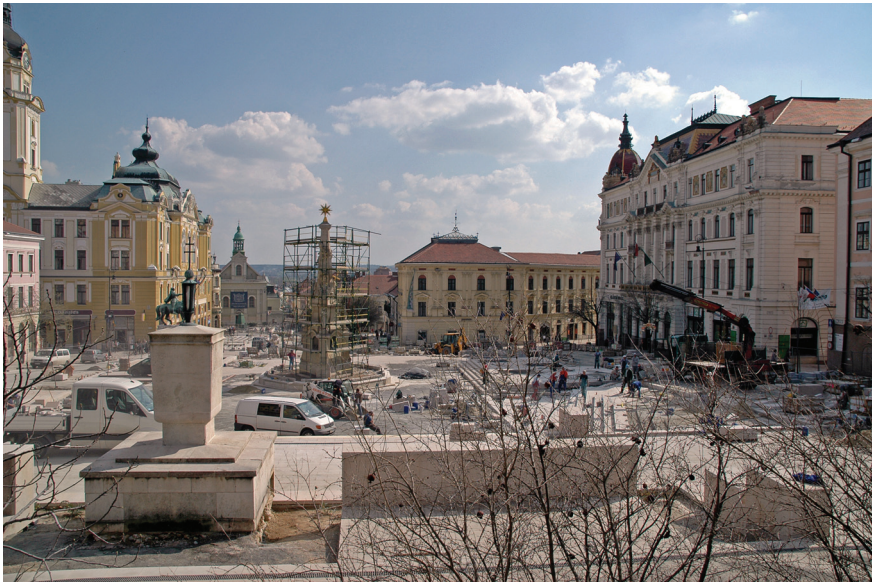
Photo 4. The hub of the city of Pécs: Széchenyi Square in mid-March 2010