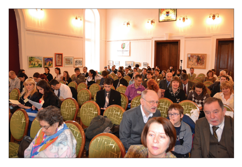
Participants of the plenary session