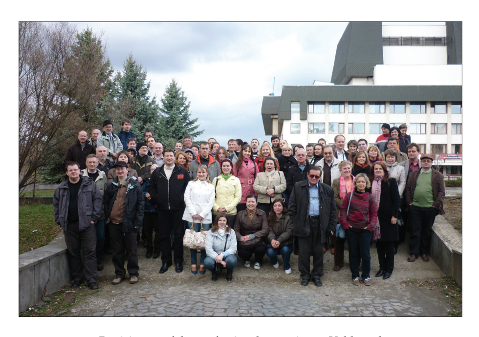
Participants of the professional excursion to Uzhhorod