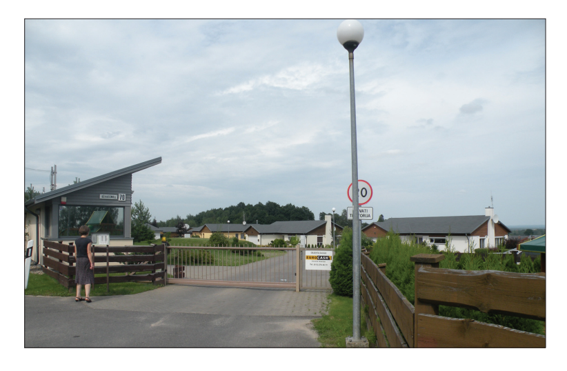
Photo 3. The entrance to "Džiaugmas" gated community