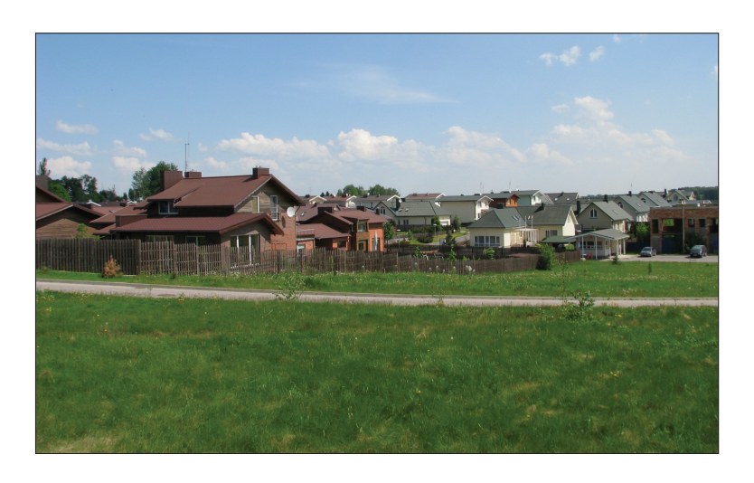
Photo 2. "Bendorėliai" the first gated community in Lithuania

"Neries kilpos" is another good example for the first gated neighbour-hoods in Lithuania. Its developer also brought the idea from the US. However, opposed to "Bendorėliai" this project was successful because its layout and development was adjusted to the local market. Part of the success was that by then due to robust economic growth, and improving welfare conditions and credit opportunities demand for gated housing significantly increased on the market. As a result of growing income among better off households exclusive housing projects became more and more attractive.