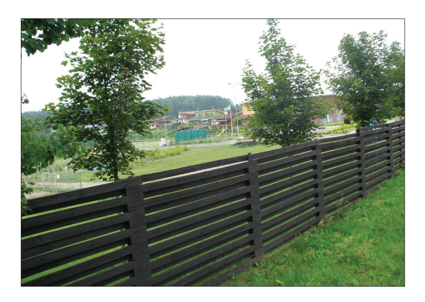
Photo 1. Fences of "Neries kilpos" gated community in Vilnius

living in "Neries kilpos", six with representatives of the municipality, architects and developers of the "Neries kilpos" neighbourhood.