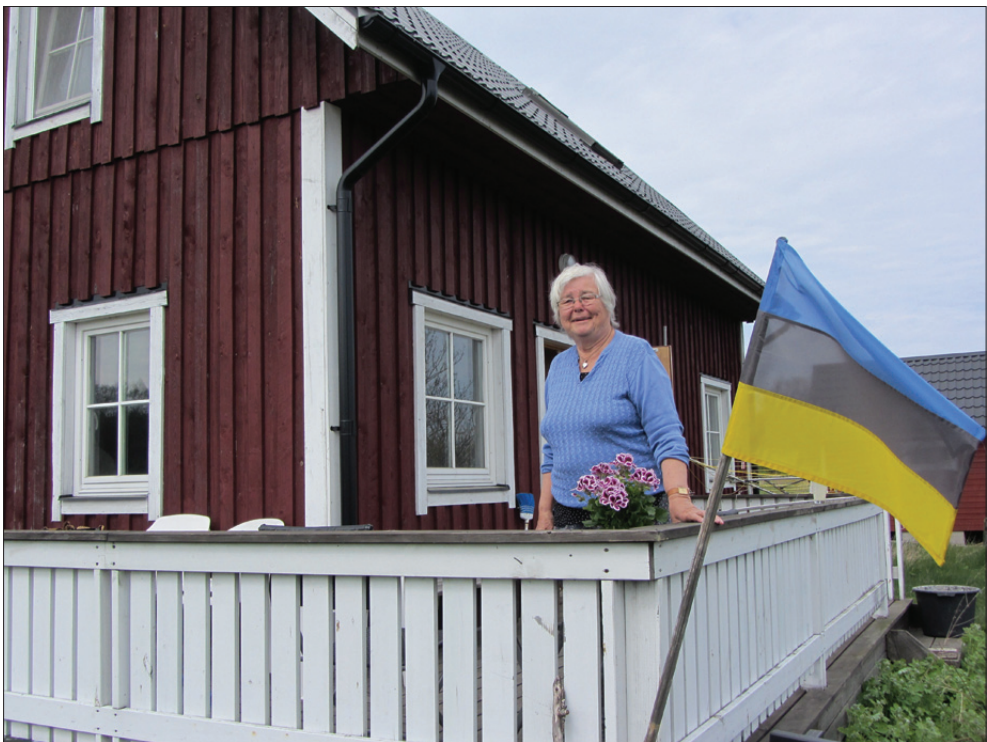
Photo 1. Permanent Estonian-Swedish inhabitant with Aiboland's flag in Noarootsi

Our case study area used to be the area inhabited by Estonian Swedes or Costal Swedes (in Swedish Estlandssvenskar and colloquially, Aibofolke ) in the largest number before World War II. The beginning of continuous settlement in these areas (known as Aiboland) dates back to the 13 th century. According to the 1934 census, 7,641 Estonian Swedes lived in Estonia. About 7,000 of them fled to Sweden in 1944 (EE 2014) and only a few of them chose to stay. Newcomers from the mainland settled in the area and additional