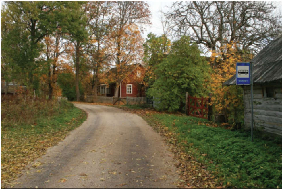
Photo 2. Norby village street view in Vormsi

permanent residents were attracted to the area by the organisation of collective farms.