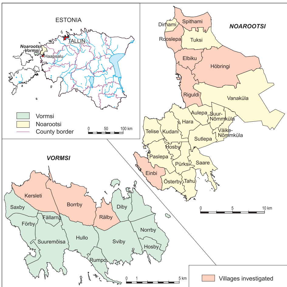
Fig 1. Location of Noarootsi and Vormsi municipalities inside Lääne county in West Estonia. In case of their 9 villages extra investigations were carried out

We chose two rural municipalities – Noarootsi and Vormsi in West Estonia – with a high share of recreational population (Figure 1). Both of them are well-discussed