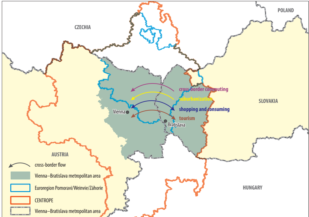
Fig. 1. CBI in the Vienna–Bratislava metropolitan area.

day socio-economic terms. Since the 1990s, the border has been characterized by extensive institutional frameworks, including multiple Euroregions (e.g. Galicia–Norte de Portugal, EuroACE), EGTCs (e.g. Duero–Douro, Rio Minho), and other CBC structures, which have contributed to a comparatively high degree of formalized cross-border governance and project-based cooperation. In particular, the density of EGTCs is substantially higher than in Central Europe. However, despite this comparatively strong institutional dimension and related capacity, many border sections continue to display relatively weak functional integration characterized by low population density, demographic decline, limited cross-border commuting, weak labour-market integration, and relatively low intensities of ordinary cross-border mobility outside a few metropolitan or coastal areas (PODADERA RIVERA, P. and CALDERÓN Vázquez, F.J. 2018). These contrasting configurations illustrate