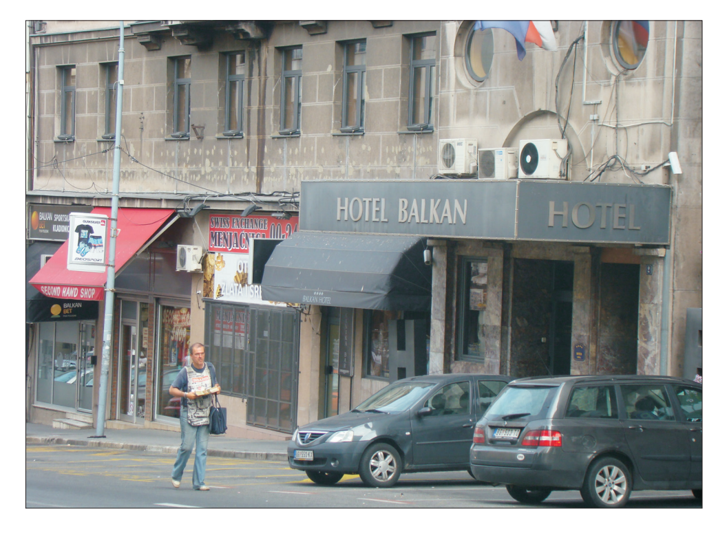
Photo 1. Hotel Balkan in Belgrade: where tourists can be positively disappointed too

These examples prove that inherent negative associations can be converted into positive ones by transforming the geographical names into brand names used in tourism. This is largely facilitated by the fact that tourism is one of the economic sectors associated with the highest number and most favourable pieces of news (WTO 2002).