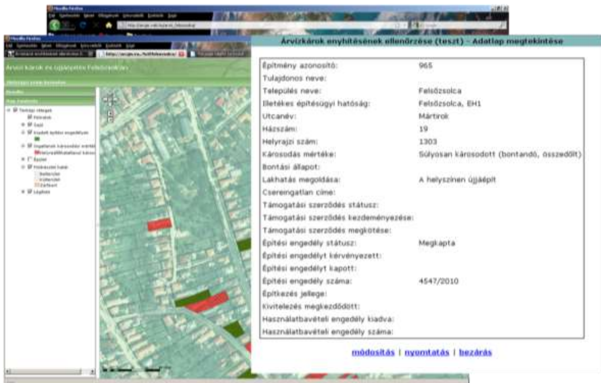
Figure 2. Damage mitigation checklist, (source: Ministry of Interior, Hungary)

Within the TeIR system, the data series of residential buildings containing real processes and their map display were published in a stand-alone application, which enabled the continuous monitoring of the damage mitigation.