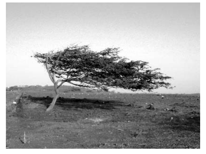
Figure 1. Landscape on the volcanic island of Santiago (Cape Verde archipelago), Post Hill area, probably as it was seen by DARWIN when visited it as a geologist.